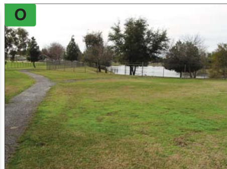
Basin O/Thomas Breckenridge Park - Bullard Avenue, east of First Avenue in Fresno.