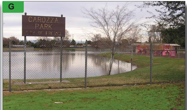
Carozza Park (Basin G), near Ewing Elementary, was the first dual-use basin developed within the City of Fresno following adoption of a joint maintenance and operation agreement between the District and the City in 1965.