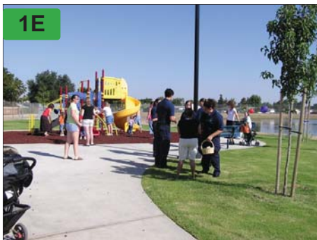
Basin 1E - Ashlan Avenue, west of Fowler Avenue in Clovis.