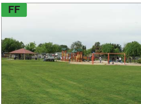
Basin FF/Sunset Park - Eden Avenue, east of West Avenue in Fresno.