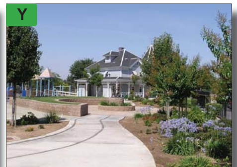
Basin Y/Trolley Creek Park - Huntington Avenue, east of Willow Avenue in Fresno.