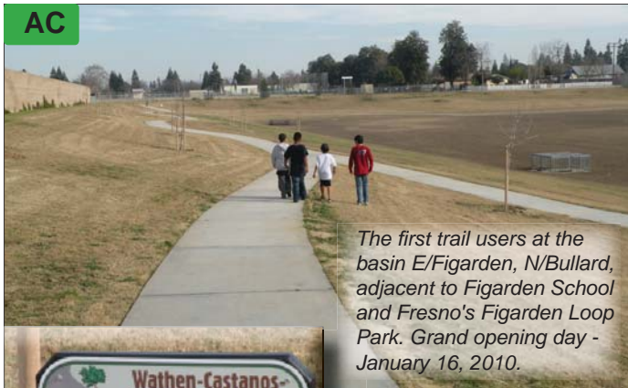
The first trail users at the basin E/Figarden, N/Bullard, adjacent to Figarden School and Fresno's Figarden Loop Park. Grand opening day - January 16, 2010.

Below is a sampling of the dual use recreation basins open to the public for seasonal use, generally between April 1 and October 1 each year.