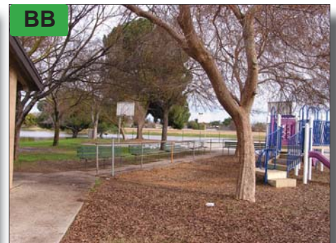
Basin BB - Fresno Street, north of Shields Avenue in Fresno.