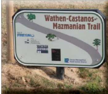
Shown left - The trail's sponsors; Wathen-Castanos-Mazmanian, City of Fresno, The Clovis Community Foundation, The Fresno Regional Foundation, and Fresno Metropolitan Flood Control District.